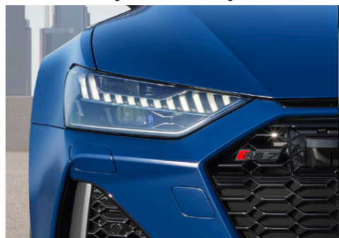
HD Matrix LED headlights with Audi laser light