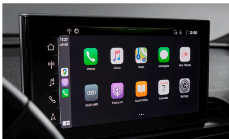
MMI touch display, compatible with Apple CarPlay and Android Auto