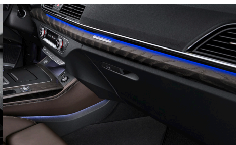
Ambient lighting package plus