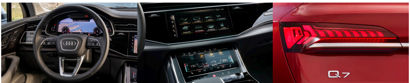
LED rear lights with dynamic indicators

Actual specifications may vary from model shown.