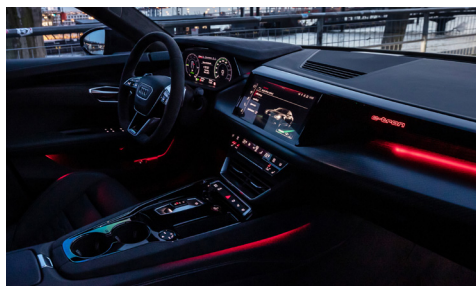
Ambient lighting package plus