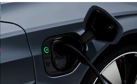
Fast charging with DC at up to 270 kW and AC at up to 11 kW